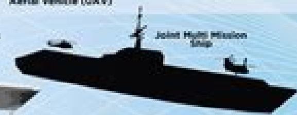
Joint Multi Mission Ship