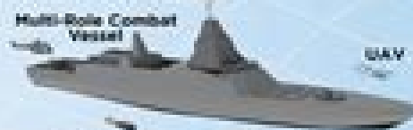
Multi-Role Combat Vessel