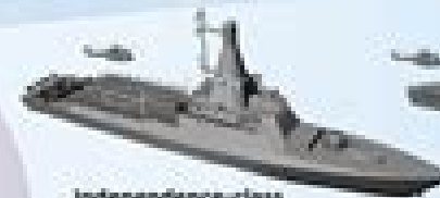
Independence-class Littoral Mission Vessel