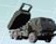
High Mobility Artillery Rocket System