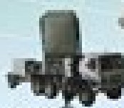
TPQ-53 Weapon Locating Radar