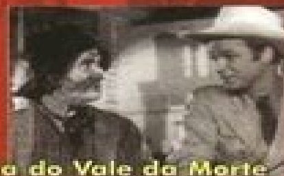
Legenda do Vale da Morte