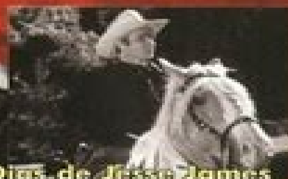
Dias de Jesse James

UMA LENDA DO VELHO OESTE EM SEUS MELHORES FILMES!