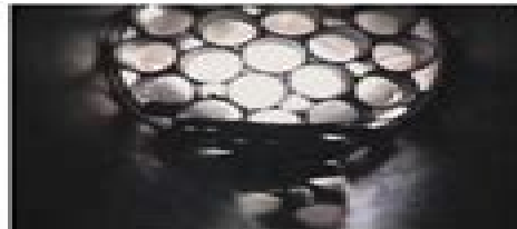
Debris. Bias errors can result if debris is trapped upstream of straightening vanes.

Abnormal operating conditions can affect the orifice meter's primary measurement elements, the tube and plate, creating bias errors. These errors can be generally categorized as pipe effects and plate effects. Detailed knowledge of these effects is necessary to identify and eliminate the measurement errors they can produce.