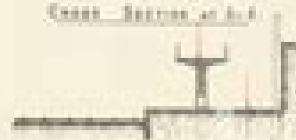
Cross Section at B-C.