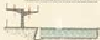
Cross Section at H-I.