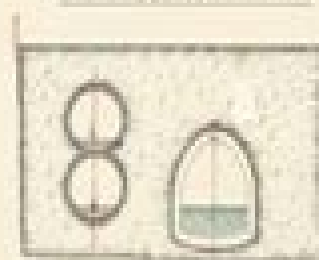
Cross Section at L-M.