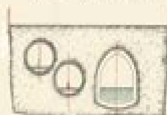
Cross Section at K-L.