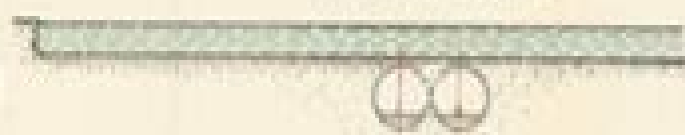
Cross Section at D-E.