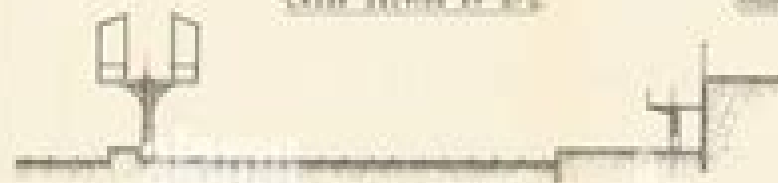
Cross Section at A-B.