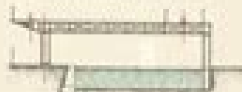
Cross Section at I-J.