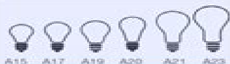
A15 A17 A19 A20 A21 A23