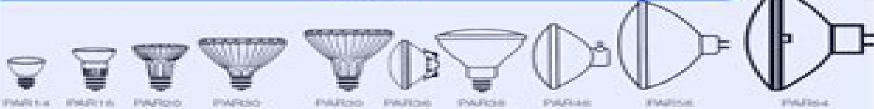
PAR14 PAR16 PAR20 PAR30 Short Neck PAR30 Long Neck PAR36 PAR38 PAR46 PAR56 PAR64