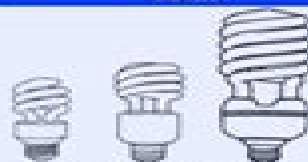
T2 Coil T3 Coil T4 Coil