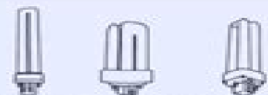
Twin Tube Triple Tube Quad Tube