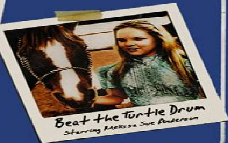
Beat the Turtle Drum Starring Melissa Sue Anderson