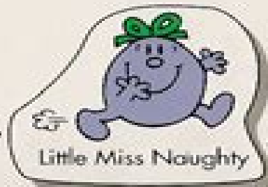
Little Miss Naughty