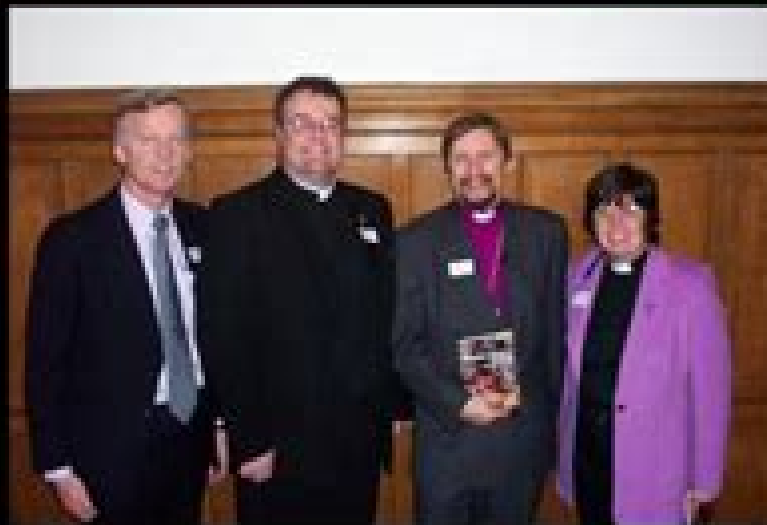
Some of the working group