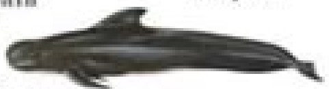
Short-finned Pilot Whale