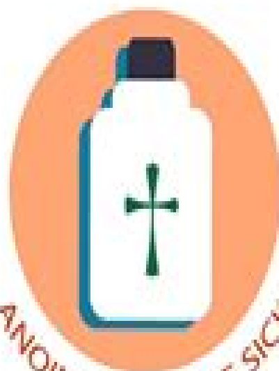
ANCOINTING OF THE SICK