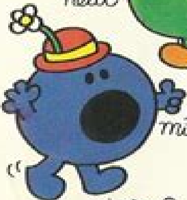
little Miss Bossy