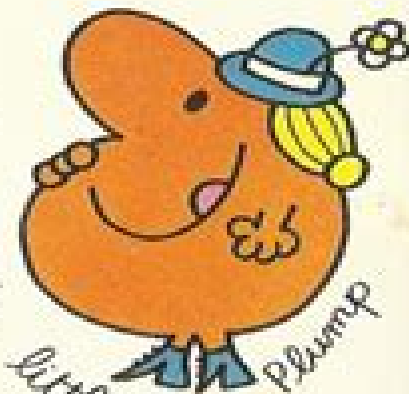
little Miss Plump