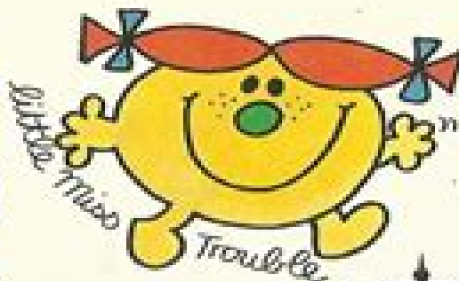
little Miss Trouble