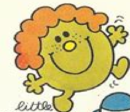
little Miss Late