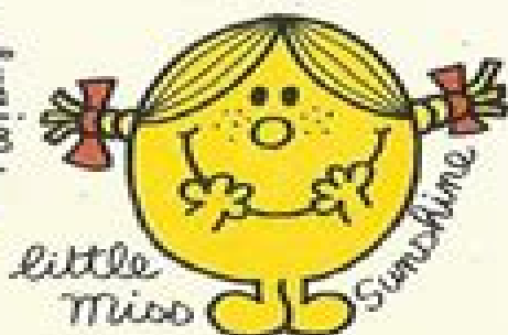
little Miss Sunshine