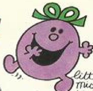
little Miss Naughty