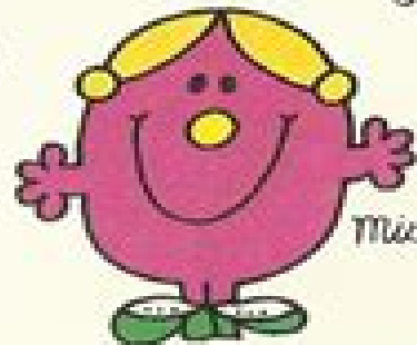
little Miss Helpful