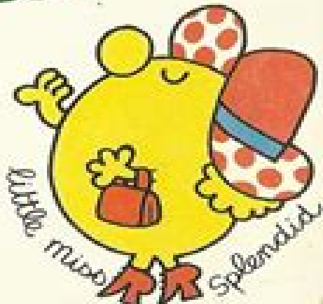
little Miss Splendid