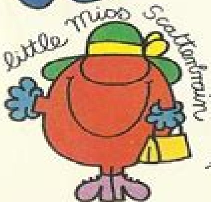
little Miss Scatterbrain