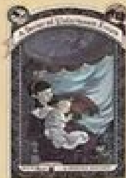
«THE WISE WINDOW»