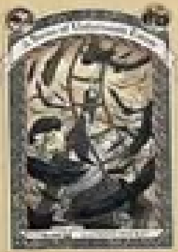
«THE WILD VILLAGE»