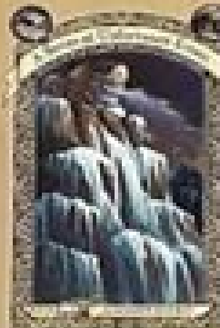
«THE SLIPPERY SLOPE»