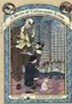
«THE AUSTERE ACADEMY»