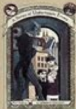
«THE BAD BEGINNING»