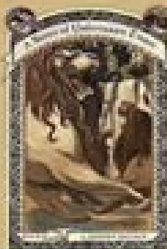
«THE CANNIBAL'S COBERT»