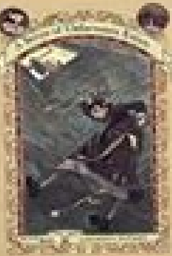
«THE GREAT ELEVATOR»