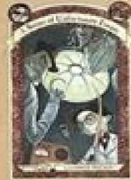
«THE HOSTILE HOSTESS»