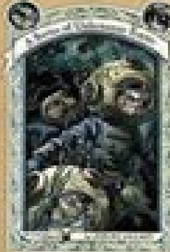
«THE GRIM GASTRO»