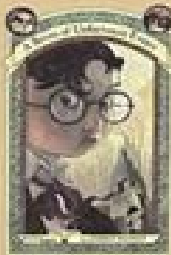
«THE MISERABLE MILL»