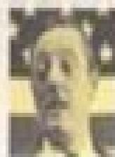
William F. Buckley Jr. ...