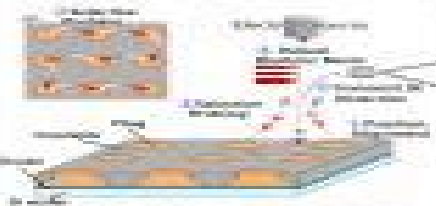
Fig. 2: Selective probing method

To estimate electrical properties, the selective probing method targets signal with defined electron beams and measures the transient signals of electrical capacitance elements (ECC). The transient signals are dynamic voltage response (VCC) which reflects dynamics on localized semiconductor columns with pin electrical properties. Therefore, transient features in the signal contain at least one signal, which enables the measurement of the device's resistance and capacitance. The distribution of electrical characteristics, yield of factors and the basic electrical parameters within inspection can be evaluated by using these features in electrical circuit.