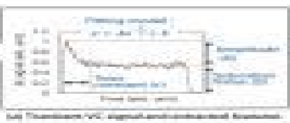
Fig. 3: Selective probing output