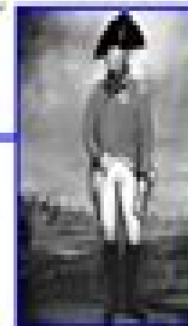
Portrait of the Hanoverian George III, by Sir Allan Ramsay

king of Great Britain and Ireland reigned 1760–1820