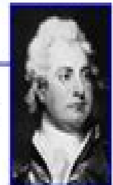
Portrait of the Hanoverian William IV, by Sir Allan Ramsay

king of United Kingdom reigned 1830–1837