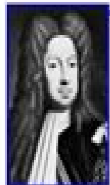
Portrait of the Hanoverian George I, by Sir Godfrey Kneller

In 1801, during the reign of King George III, the Act of Union formally united Great Britain and Ireland under the name of the United Kingdom of Great Britain and Ireland.