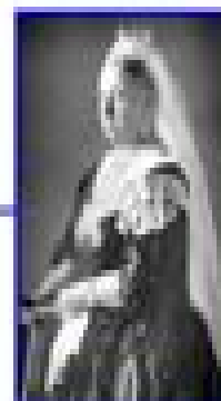
Portrait of the Hanoverian Victoria, by Sir Allan Ramsay

queen of United Kingdom reigned 1837–1901 [See House of Windsor]