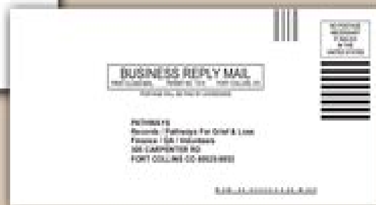
Business Reply Envelope