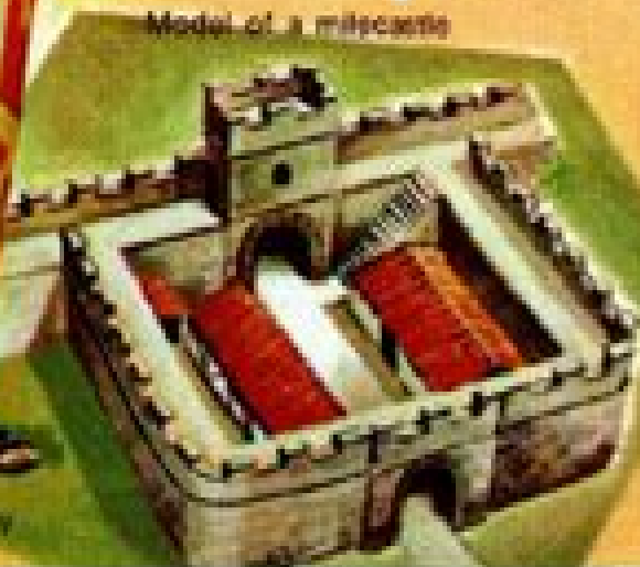
Model of a millicastum