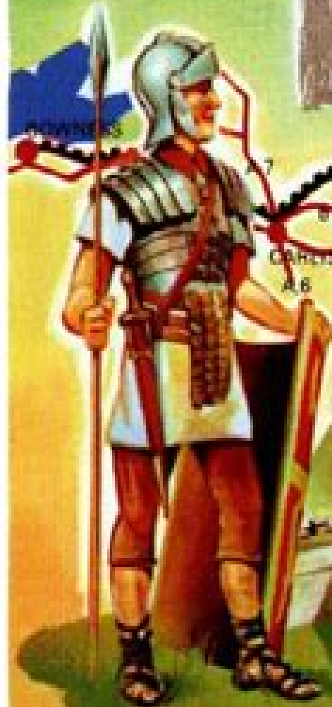
Model of a legionary