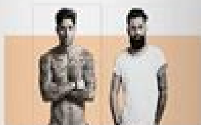
On Tattoos The man on the left is a professional bodybuilder, and the man on the right is a professional athlete.

They are the men who are not just about looks, but about attitude, about the way they carry themselves, the way they talk, the way they live. They are the men who are redefining the image of a man in the city.