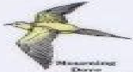
Noddy Dove Zenaidura macroura 12"