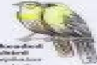
Yellow-headed Blackbird Xanthocephalus americanus 10"