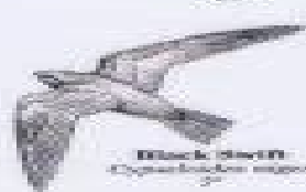
Black Swift Cypseloides niger 5"