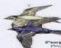
Purple Martin Progne subis 9"