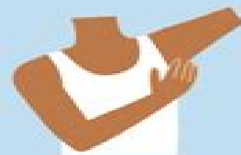
Loss of armpit and pubic hair