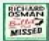
Late September release Viking Australia