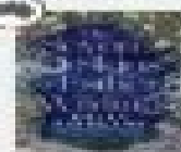
October release 4th Estate