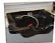
Look! Barbershops have it