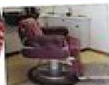
When you get your hair cut, get that hair and styling and...