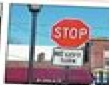
If you ride a bike, obey the same traffic signs cars do. Stop completely at stop signs and stop lights.