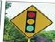
Whether you are riding a bike or walking, there are many signs that you need to stay in the city.