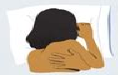
Difficulties with orgasm