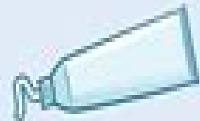
CREAMS or GELS