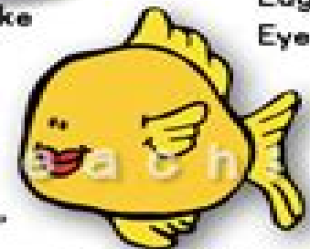
Lips the Fish