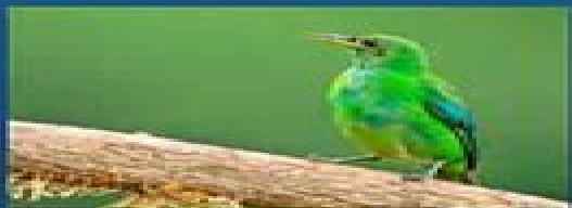
7. GREEN HONEYCREEPER