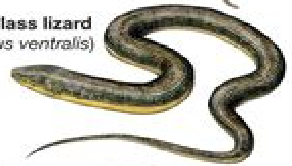
eastern glass lizard ( Ophisaurus ventralis )