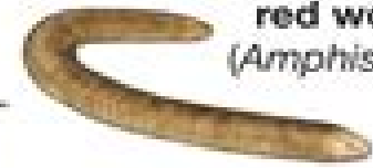
red worm lizard ( Amphisbaena alba )