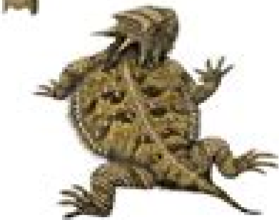
Texas horned lizard ( Phrynosoma cornutum )