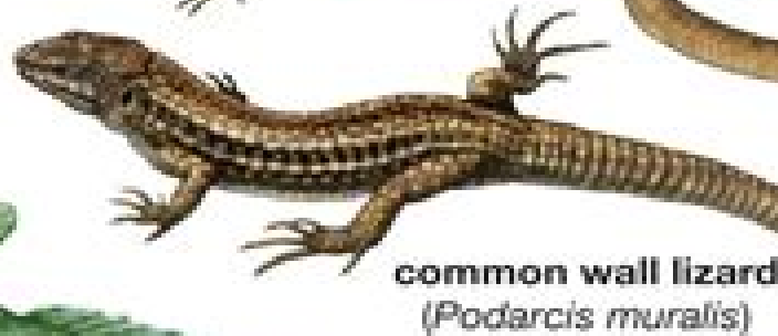
common wall lizard ( Podarcis muralis )