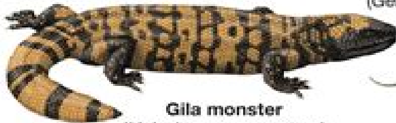
Gila monster ( Heloderma suspectum )