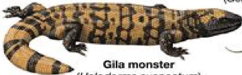
Gila monster ( Heloderma suspectum )