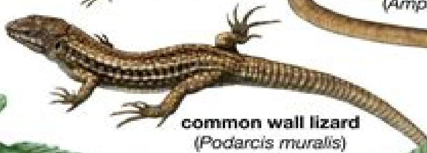
common wall lizard ( Podarcis muralis )