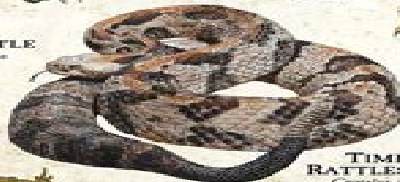
TIMBER RATTLESNAKE Crotalus horridus