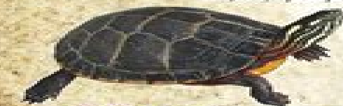
EASTERN PAINTED TURTLE Chrysemys picta picta