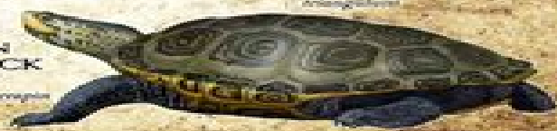
NORTHERN DIAMONDBACK TERRAPIN Malaclemys terrapin terrapin