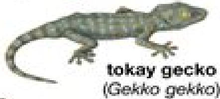
tokay gecko ( Gekko gekko )