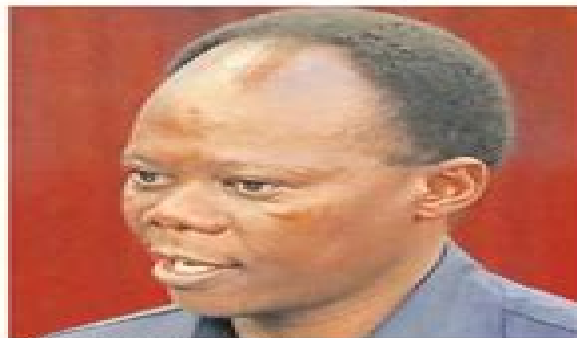
Health deputy minister Gubalo Mbatia