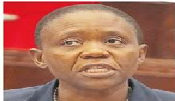
Health minister Dorothy Gwajima

After experts presented their recommendations earlier in the week, Health ministry bigwigs could find themselves in a fix, having ruled out vaccinations in Tanzania only a few months ago, and promoted unproven remedies for the respiratory illness PAGE 2