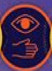
Skin or eye contact