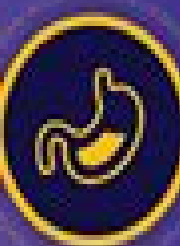
Swallowing (ingestion or eating)