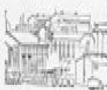
THE HISTORY OF THE MARKETING CONCEPT

THE FUNDAMENTALS OF MARKETING, 10th Edition