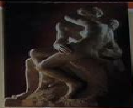
The Seated Figure, 1960s