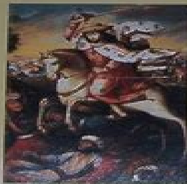
Warrior on Horseback, 1960s