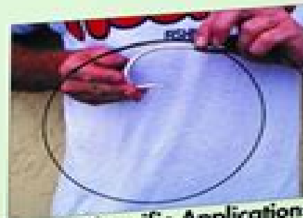
Species Specific Applications

Learn How to Rig Balleyhoo, Mullet & Mackerel to Catch Big Game Fish