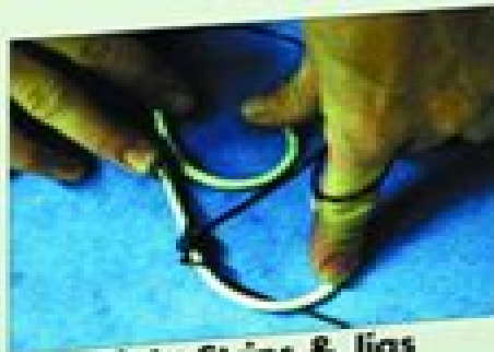
Plain Strips & Jigs