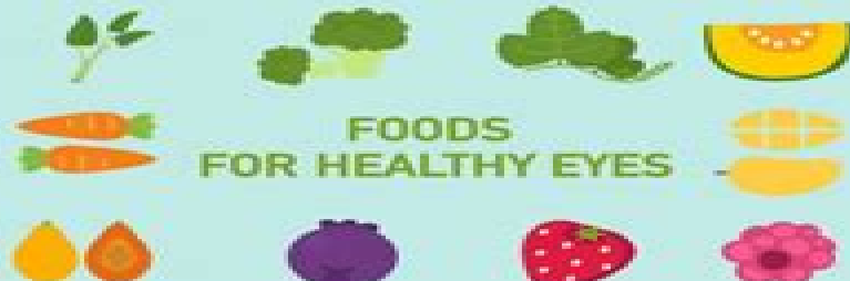
FOODS FOR HEALTHY EYES