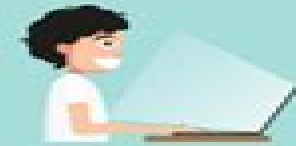
90.99% Computer Vision