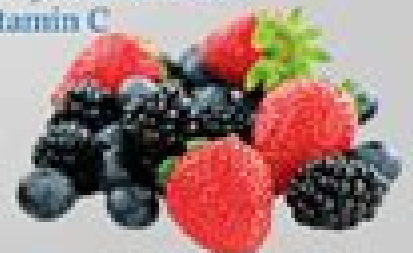
Berries - Packed with antioxidants, vitamins and fiber