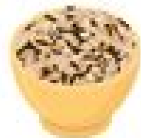
Brown Rice, Quinoa