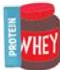
Protein Bars + Powder