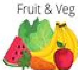
Fruit & Veg