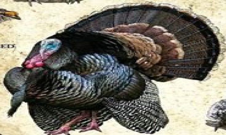
WILD TURKEY Meleagris gallopavo