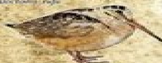
AMERICAN WOODCOCK Scotopelia minor