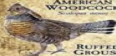
RUFFED GROUSE Bonasa umbellus