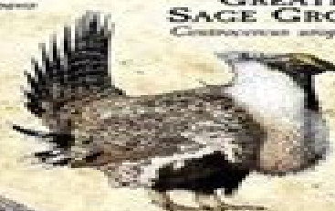
GREATER SAGE GROUSE Centrocercus urophasianus