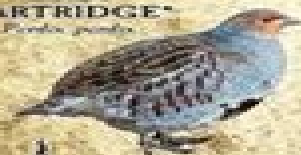
GREY PARTRIDGE* Perdix perdix