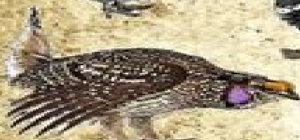
SHARP TAILED GROUSE Tympanuchus phasianellus