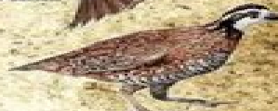
NORTHERN BOBWHITE Colinus virginianus