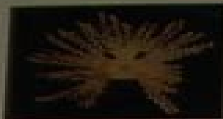
Sunburst, 1989, D. C. A. S. S. S.