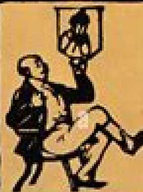
Proprietor of white Slaves