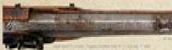
No. 45-A Bayonet Smooth Rifle

This rifle is a smooth-bore rifle, and the bayonet is attached to the muzzle. The rifle is shown in a side view, and the bayonet is clearly visible at the end of the barrel. The rifle is a long-barreled weapon, typical of the colonial era.