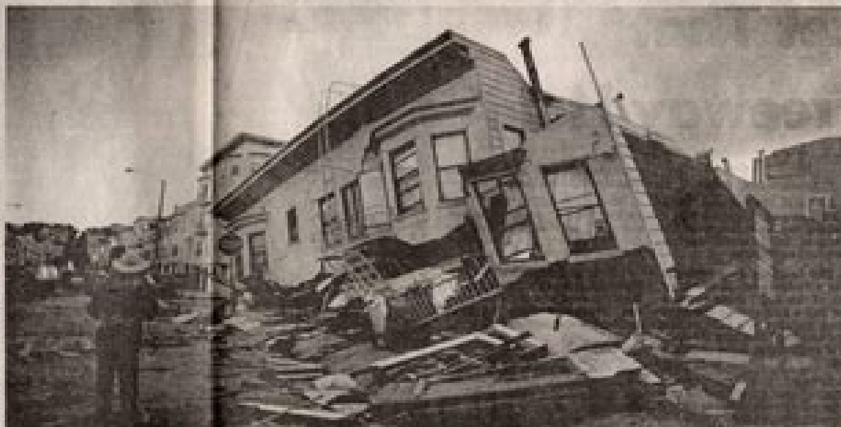
Wreckage of house on Scott Street at the intersection of Beach Street