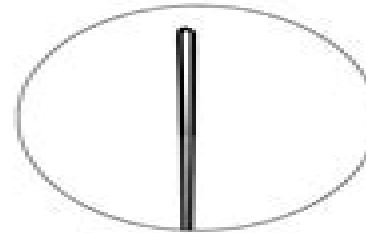
Single String Loop