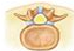
Normal newborn vertebra