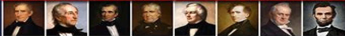
9 th WILLIAM H. HARRISON (1841) 10 th JOHN TYLER (1841-1845) 11 th JAMES K. POLK (1845-1849) 12 th ZACHARY TAYLOR (1849-1850) 13 th MILLARD FILLMORE (1850-1853) 14 th FRANKLIN PIERCE (1853-1857) 15 th JAMES BUCHANAN (1857-1861) 16 th ABRAHAM LINCOLN (1861-1865)