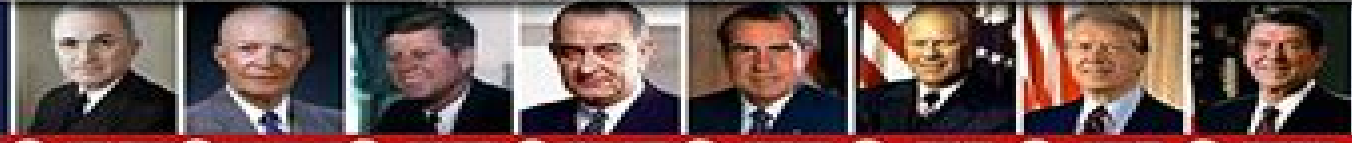
33 rd HARRY S. TRUMAN (1945-1953) 34 th DWIGHT D. EISENHOWER (1953-1961) 35 th JOHN F. KENNEDY (1961-1963) 36 th LYNDON B. JOHNSON (1963-1969) 37 th RICHARD NIXON (1969-1974) 38 th GERALD R. FORD (1974-1977) 39 th JIMMY CARTER (1977-1981) 40 th RONALD REAGAN (1981-1989)