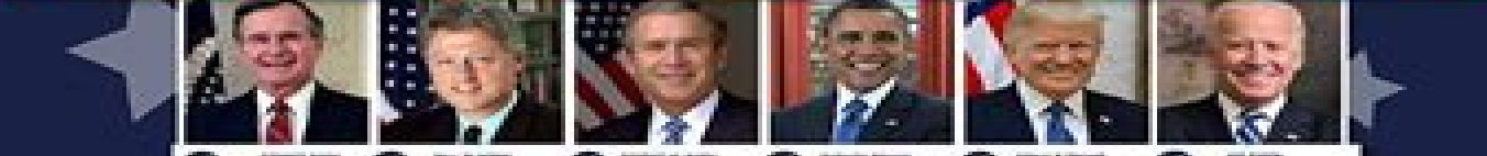
41 st GEORGE H.W. BUSH (1989-1993) 42 nd BILL CLINTON (1993-2001) 43 rd GEORGE W. BUSH (2001-2009) 44 th BARACK OBAMA (2009-2017) 45 th DONALD TRUMP (2017-2021) 46 th JOE BIDEN (2021-)