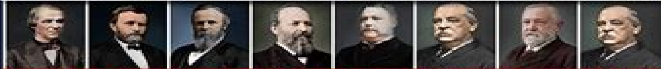
17 th ANDREW JOHNSON (1865-1869) 18 th ULYSSES S. GRANT (1869-1877) 19 th RUTHERFORD B. HAYES (1877-1881) 20 th JAMES A. GARFIELD (1881) 21 th CHESTER ARTHUR (1881-1885) 22 th GROVER CLEVELAND (1885-1889) 23 th BENJAMIN HARRISON (1889-1893) 24 th GROVER CLEVELAND (1893-1897)