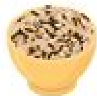
Brown Rice, Quinoa