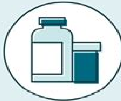
Administration of medication