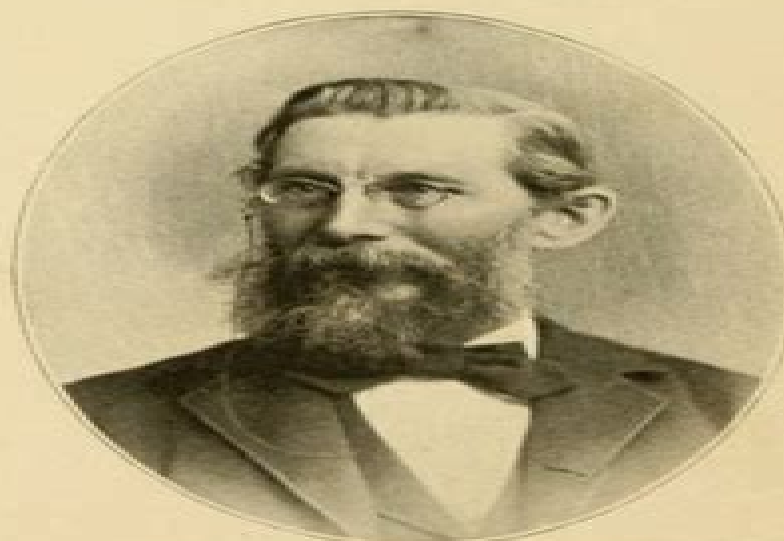
LEWIS EDSON WATERMAN PRESIDENT L. E. WATERMAN CO., IDEAL FOUNTAIN PENS INVENTOR OF THE FIRST SUCCESSFUL FOUNTAIN PEN