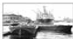
FEBRUARY Boats in the Royal Albert Docks, circa 1965