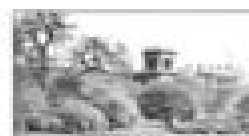
MAY St James's Park, circa 1960