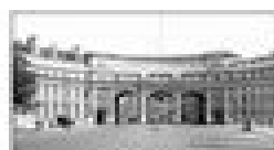
MARCH The Admiralty Arch, circa 1920