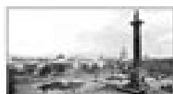
JANUARY Nelson's Column & Trafalgar Square, circa 1920

London has a fascinating history, which is brought to life in these wonderful images from The Francis Frith Collection. The twelve photographs in this calendar provide a window on the past, showing us how the face of London has changed over the decades, and how people lived their lives in this diverse and dynamic city.